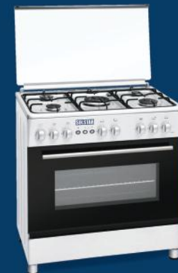
SO 690 SS