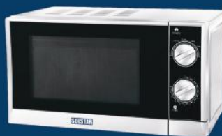
MWO M20 WHV SS