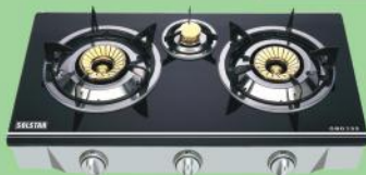
GBG 3 SS