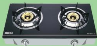
GBG 2 SS