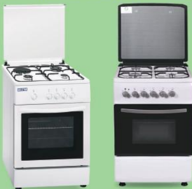
SO 106 SS