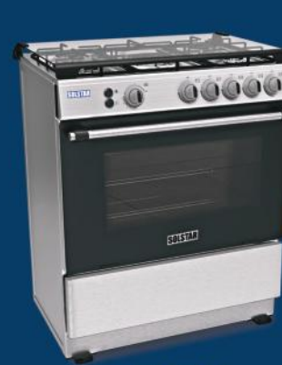
SO 582 SS