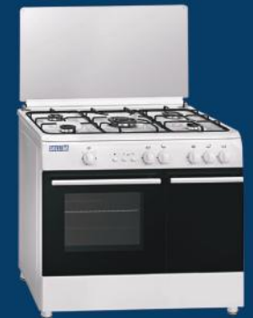
SO 590 SS