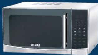
MWO D34-GSLV SS