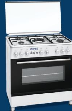
SO 680 SS