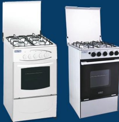
SO 201 SS