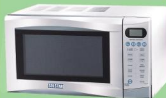
MWO D25-GSLV SS