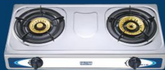
GB 2 SS